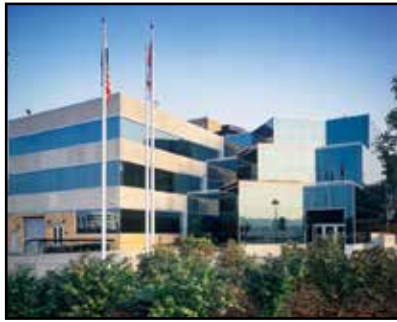
Croatian Fraternal Union of America Founded in 1894 Periodicals Postage Paid at Pittsburgh, PA

POSTMASTER: Send address changes to Zajedničar , 100 Delaney Dr., Pittsburgh, PA 15235